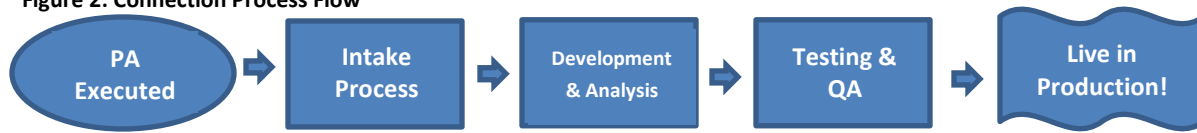
Figure 2: Connection Process Flow

The process to set up an initial connection to NC HealthConnex follows the steps listed in Figure 2 . At each step in the connection workflow there may be actions required of the participant, the entity through which the participant is connecting, the North Carolina Health Information Exchange Authority (NC HIEA), and/or the NC HIEA's technical vendor SAS.